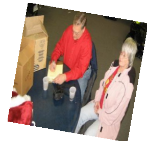
5) Santa gets ready