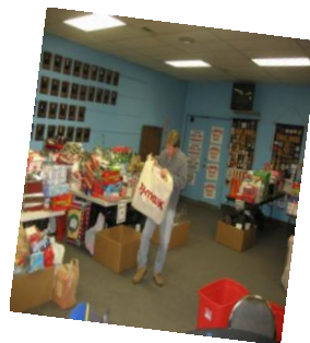
4) sorting the gifts