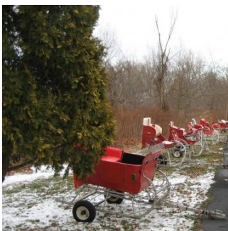
2)Preparing the Sleighs