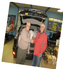
3) Delivering gifts for sorting